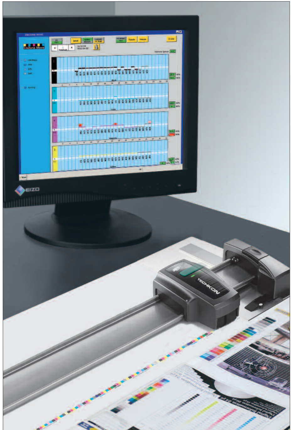
The Techkon SpectroDrive, driven by InkZone Move, is fast and easy to use.

InkZone Move supports established color measurement systems for every type of installation: the SpectroDrive/SpectroJet from Techkon and the IntelliTrax/EasyTrax from X-Rite. IZ Move connects today's scanning instruments with nearly all offset presses.